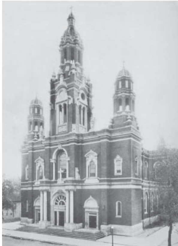
The St. Hyacinth Basilica in 1930. The Church was designed by Worthmann and Steinbach who built many of Chicago's "Polish Cathedrals".

Avondale was first incorporated as a village in 1869. Although settlement in the area begins with the extension of the Chicago, Milwaukee, St. Paul & Pacific tracks to Milwaukee in 1870 and the building of a post office at the corner of Belmont and Troy at a stop of the Chicago & North Western Railway in 1873, real development would wait until after Jefferson Township was annexed to the city in 1889. The city brought up the level of local infrastructure and even paved Milwaukee Avenue. Access to the city improved with the extension of the Milwaukee streetcar line to Jefferson Park and the building of the elevated train in neighboring Logan Square.