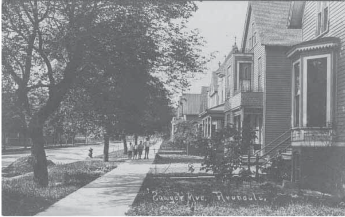
The photo shows a street scene in Avondale in 1908. Children are seen playing on the sidewalk on the west side of 3100 block of North Sawyer (near the intersection of Avondale, Sawyer, and Belmont). The houses are still standing.