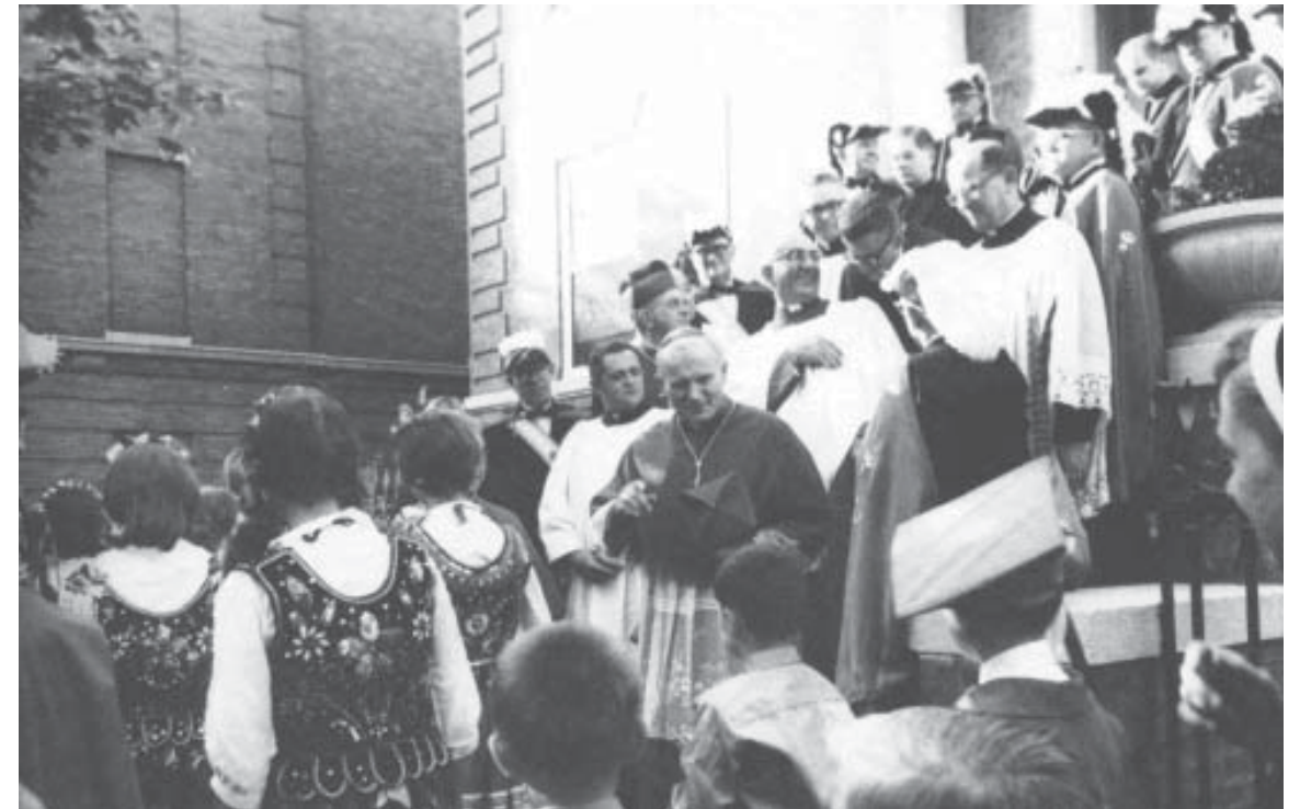
A photo of a pastoral visit by Karol Cardinal Wojtyla, the future Pope John Paul II, as the Archbishop of Cracow, at St. Hyacinth Basilica in Avondale.

Coming from Bucktown and skipping over the German and Scandinavian dominated mansions along Logan Boulevard, Polish settlement of Avondale began in earnest. By 1894 St. Hyacinth’s Roman Catholic Parish was founded for Poles in an attempt to pre-empt the establishment of a schismatic parish by the Polish National Catholic Church. St. Hyacinth’s grew to be so large that another Polish church, St. Wenceslaus had to be built to serve the Polish community, in addition to a small mission church dedicated to Our Lady of Fatima at 3051 N. Christiana.