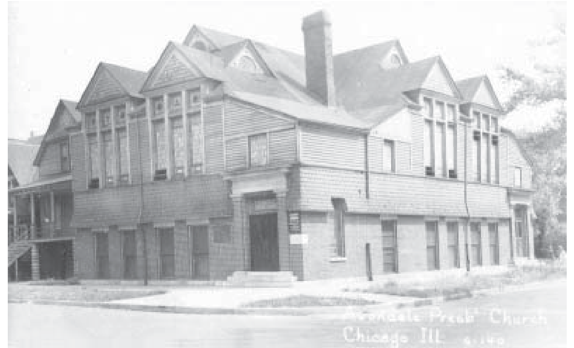
The Avondale Presbyterian Church at the northeast corner of Albany Avenue and School Street. The building was built in 1891.