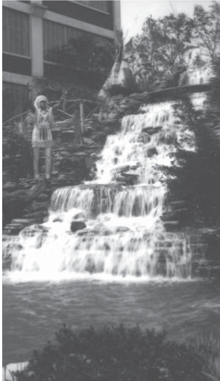
Indian Chief Stands next to the main waterfall at Diversey and Pulaski. For more photos and information see JPHS Newsletter January 2008 – Olson Waterfall