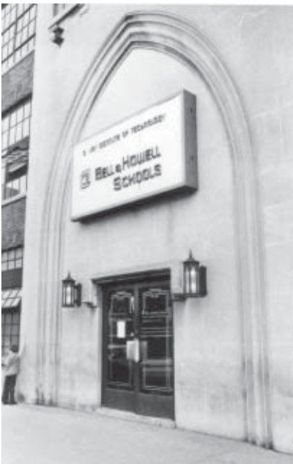
The photo at the left is the front of the DeVry University building, 4131 W. Belmont, after the Bell & Howell Schools took it over. The building has now been converted to condos.